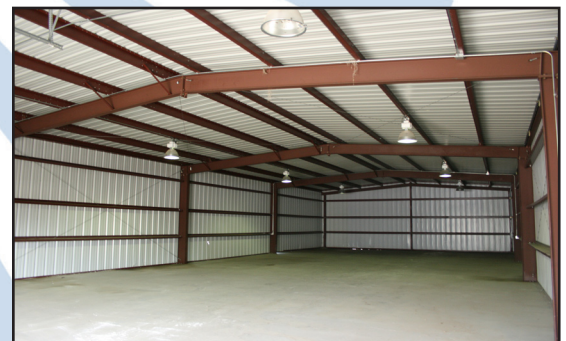
The interior of the cold storage building