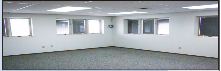
Building one has nearly 2,500 feet of office space