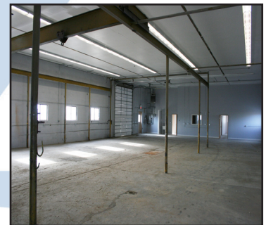
Building one's shop space