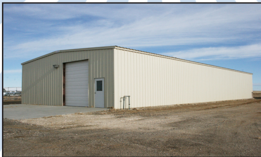
The outside of the cold storage area